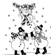
Un-Hanging of the Greens

Suggested donation is $5 per person, with all proceeds benefiting the Reno Philharmonic Youth Orchestras.